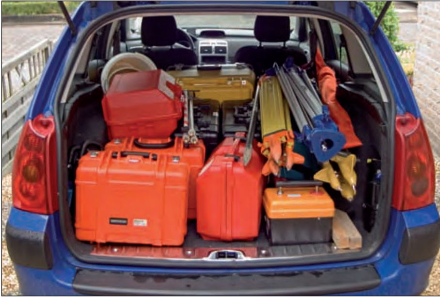
RTK GPS systems are high-volume products.