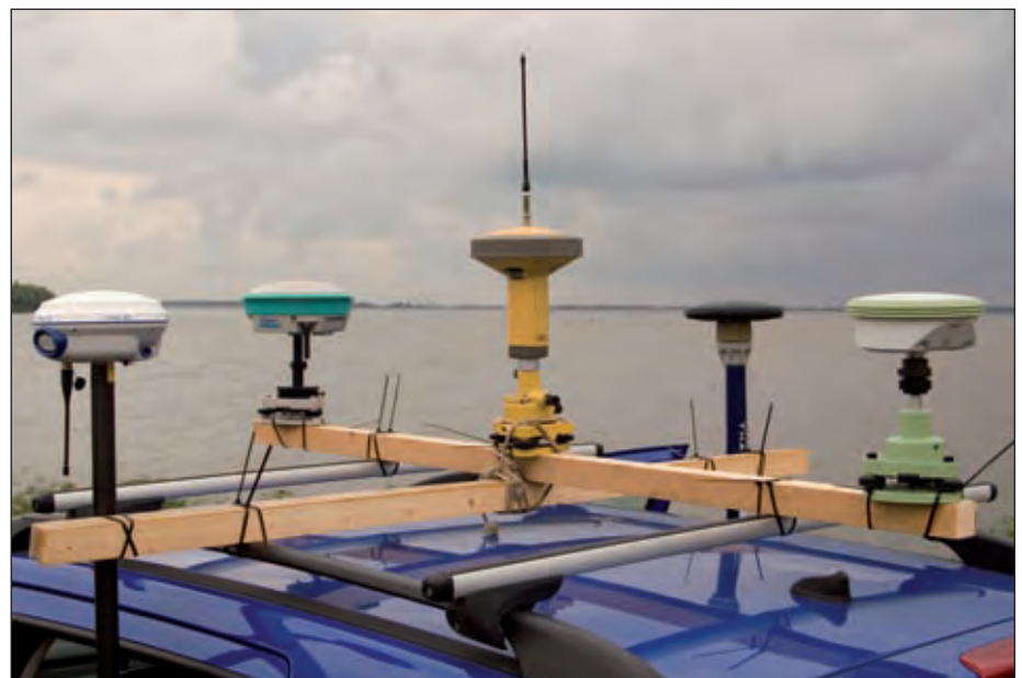
Antenna layout on the roof of the car for the range test.

The best weight/endurance results were achieved with the Topcon and the Sokkia which both had a total on-pole weight under 4 kilograms, and which lasted over 10 hours on a single set of batteries.