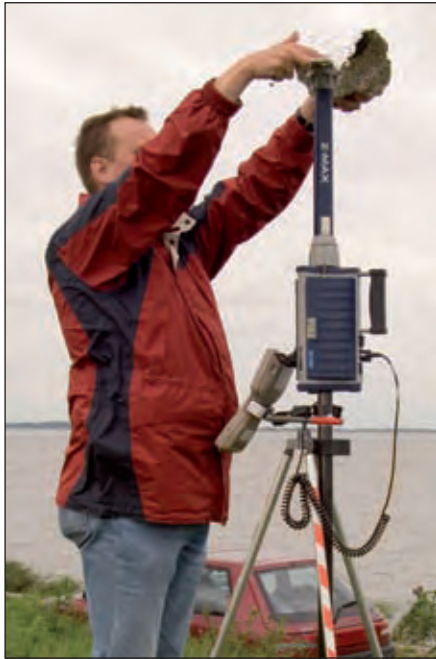
Performing the initialization test with a piece of tinfoil.

of the cases depends on the type of case and the options selected by the client. All representatives, however, claimed that the cases and options supplied were those usually selected by their clients.