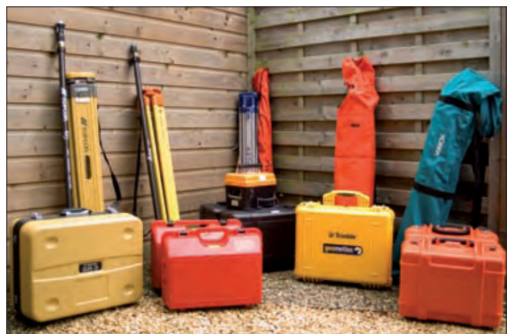
Cases, tripods and poles as delivered.

This review is divided into two parts: the table and main text describe the results of the more objective tests and comparisons, while the cadres detail the results of the practical tests, including user friendliness.