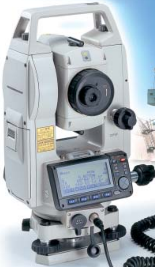
NET1200 3-D Station