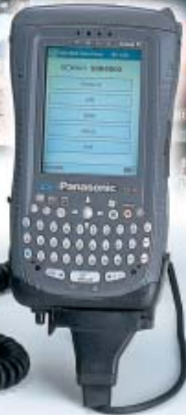
SDR4000 Control Terminal